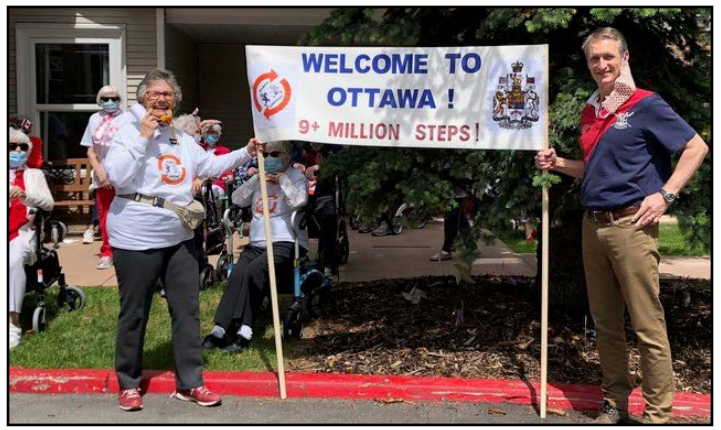
It was a pleasure this summer to watch the seniors of Manor Village at Garrison Woods walk virtually across Canada.

Many seniors tell me their costs have gone up, but the government has overlooked their needs.